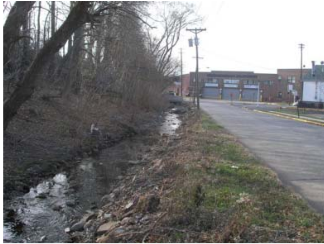
Elm Ave. creek dredged and cleaned.